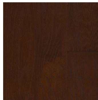
Oak - Clubhouse