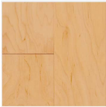
Maple - Natural

a sound isolating membrane. Three color choices are available, as shown below: