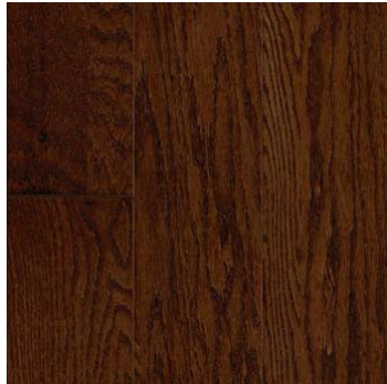
Oak - Homestead